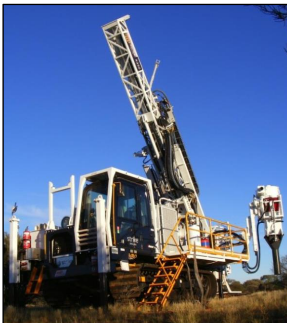
Figure 1 - Strike Drilling X350 RC Drill Rig

The agreement provides for mobilization costs as the rig is currently in WA, which will be shared by the parties, and a schedule of rates for drilling and other activities, to be paid by the party using the rig. The rig is expected to arrive in the Lachlan Fold belt in February 2021 and will immediately commence drilling on Argent's historic Pine ridge gold Mine prospect.