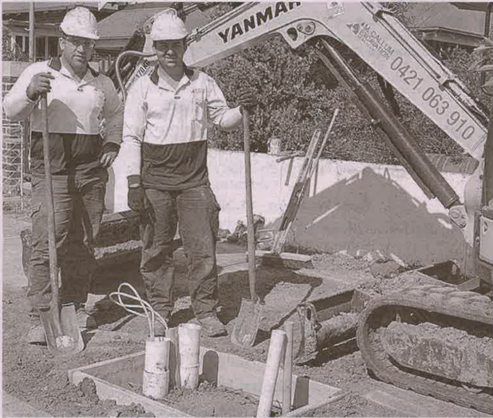
The entire Wyalong and West Wyalong township could be nbn™ live by the middle of next year.

Member for Riverina, Michael McCormack has announced a further 1700 residents and business in West Wyalong will have access to faster and more reliable internet with the rollout of the nbn™ which commenced construction last week.